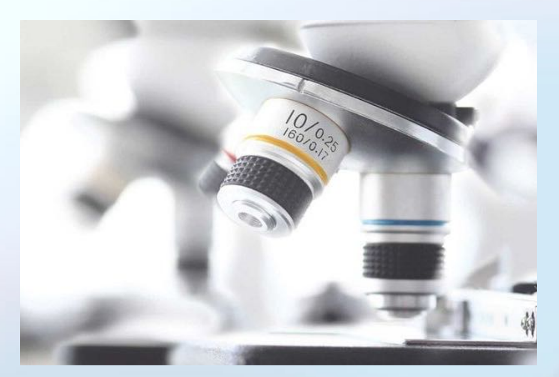
Please contact us for what you are interested in